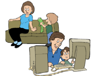
parents and sons