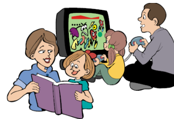
parents and daughters